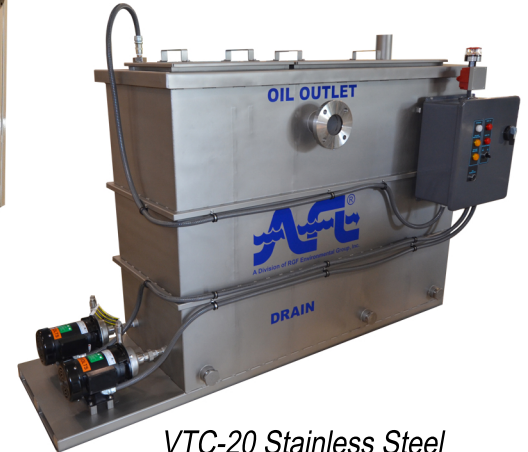
VTC-20 Stainless Steel Above Ground

314-821-4321 www.mofilco.com mofilco@mofilco.com