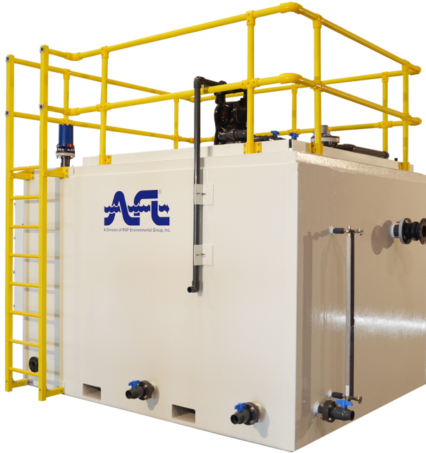
VTC-300 Fiberglass Above Ground