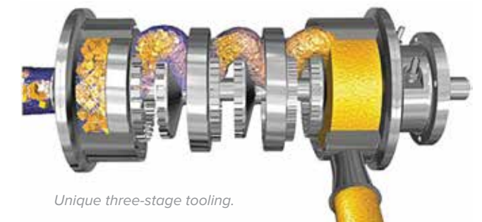
Unique three-stage tooling.