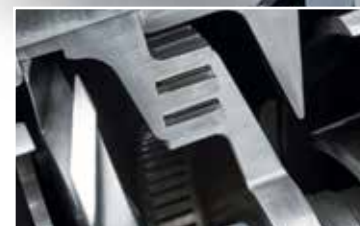
Close tolerance tooling.