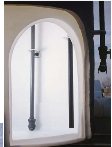
Top discharge with foot valve is optional.