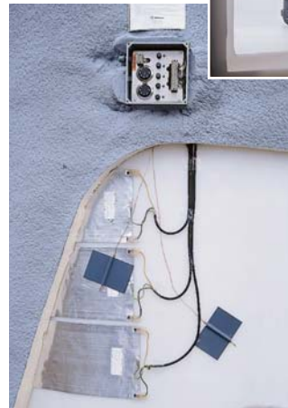
Heat tracing and insulation are available for use with temperature sensitive chemicals.