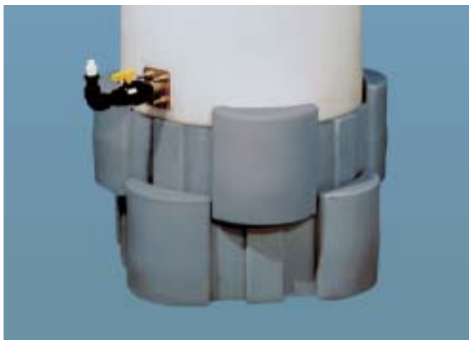
Optional polyethylene stands, which may be stacked 2-high, support the primary tank for gravity feed.