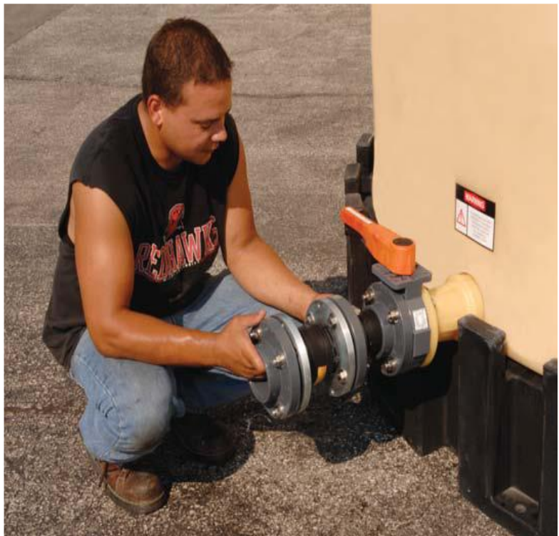
3" FDO (left) and 4" FDO (right) with flanged coupling, butterfly valve, and flexible expansion joint.