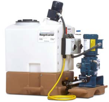
Chemigation System with 500-VS Pump