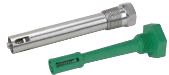
Neptune Injection Quills