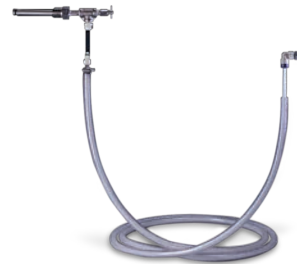
Neptune Discharge Assemblies

Discharge assemblies are designed with a connection point that features a self-sealing disconnect coupler for ease of use and enhanced safety. The outer covering is sealed at the discharge, while the inner tube is constructed of 3/8" polyethylene with a pressure fitting at each end.