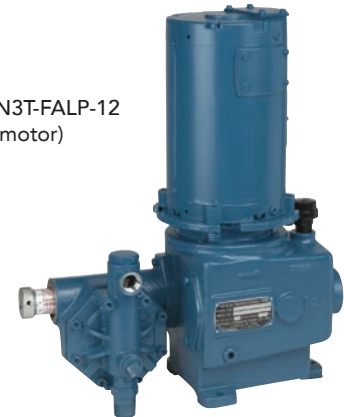
Model 535-VS-N3T-FALP-12 (12-volt motor)