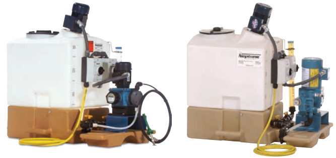
MODEL CIS-30 with 7000Z NPA Series Pump and Controls