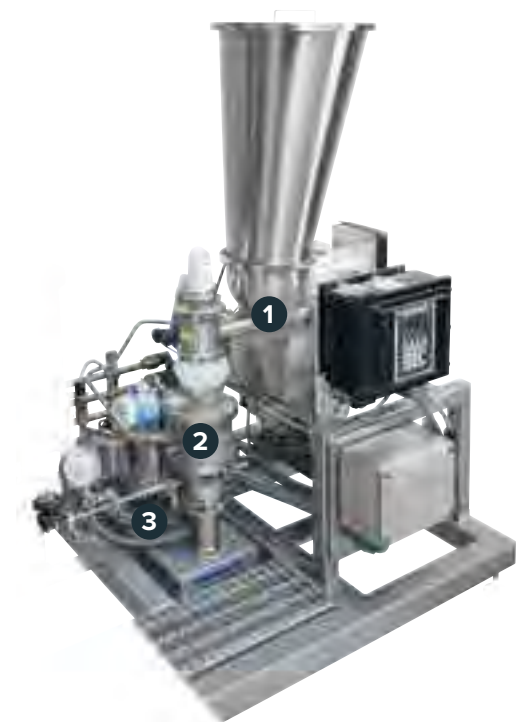
Continuous inline dispersion set-up: 1. Continuous feeder, 2. Uniform film interface (UFI) 3. ZC Powder Dispenser.