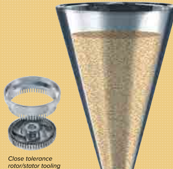
Close tolerance rotor/stator tooling

The advanced design of the ZC Dispenser's rotor/stator reactor provides intense shearing of powders prior to hydration. This leads to homogeneous suspensions free of lumps and "fish eyes".